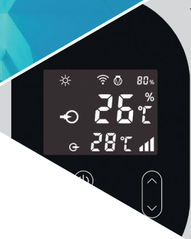
Touch screen with flow indicator

Operates at -15^{\circ}\text{C} air temperature Aluminium casing Shipped with silent footers and a winter cover